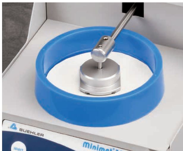
Thin Section Attachment is ideal for automatic preparation of glass slides and geological samples.