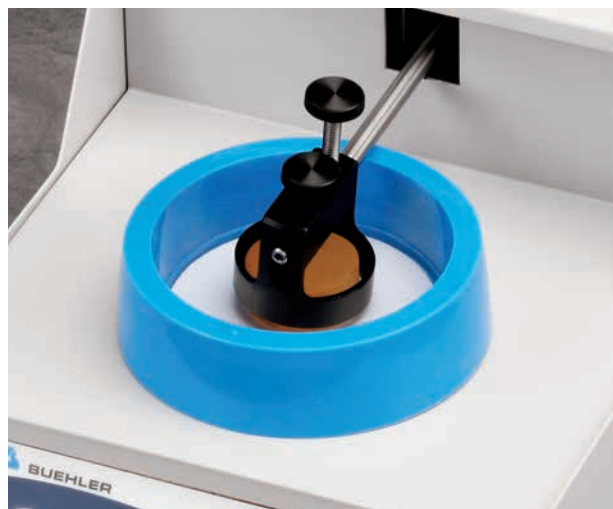
Caged Sample Holder facilitates sample preparation without the need to drill a back hole in the sample.