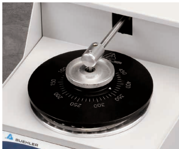
Precision Thinning Attachment enables SEM and TEM samples to be prepared.