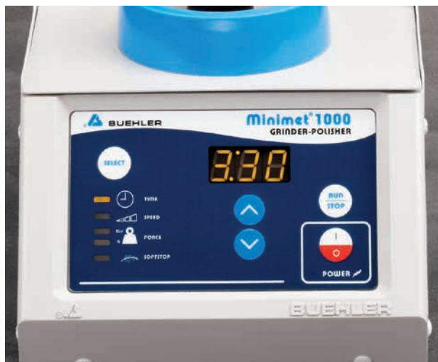
Control Panel features touch-pad controls and LED displays of all grinding/polishing parameters.