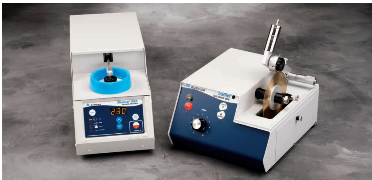
The IsoMet® Low Speed Saw is an excellent companion to the MiniMet® 1000 Grinder/Polisher including when low deformation sectioning is required prior to polishing.